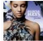
Album: The Element of Freedom